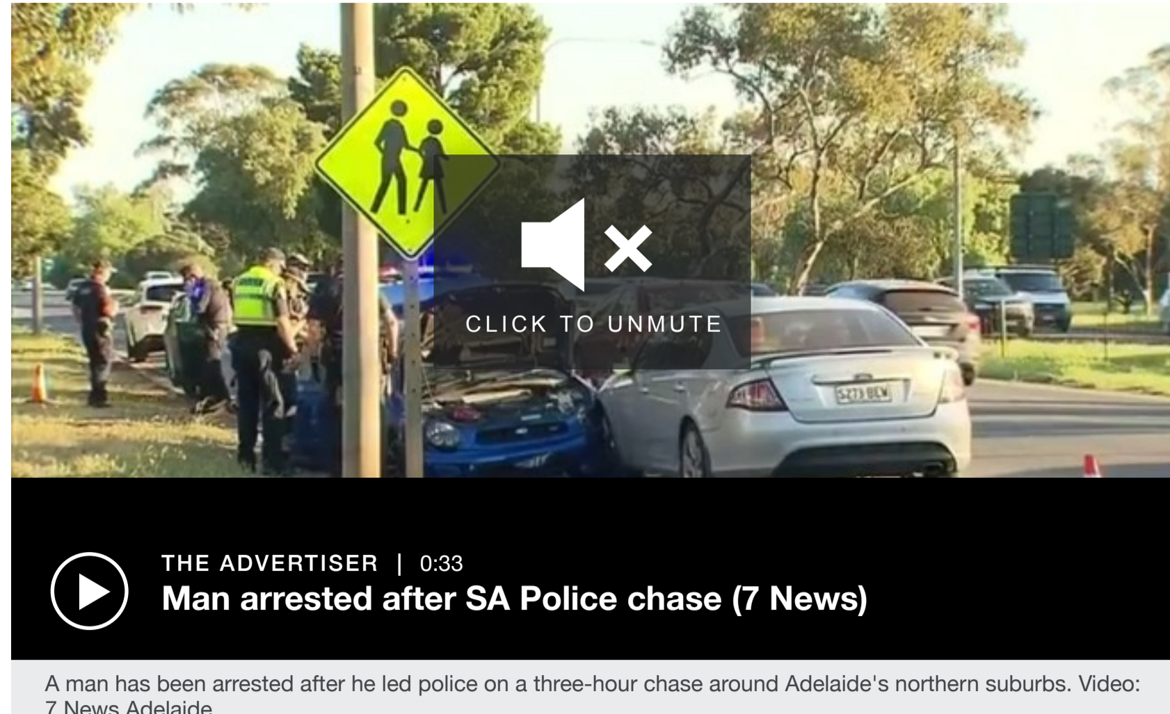
A man has been arrested after he led police on a three-hour chase around Adelaide's northern suburbs. Video: 7 News Adelaide